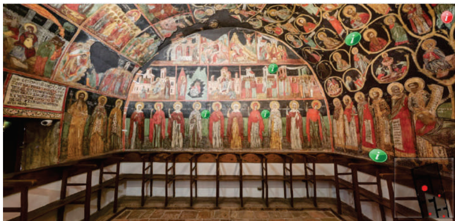
Fig. 2. The green hotspots are placed at the selected icons which are existing in BIDL database

By clicking on a hotspot, the image and description of the icon in BIDL is online presented in Bulgarian and English.