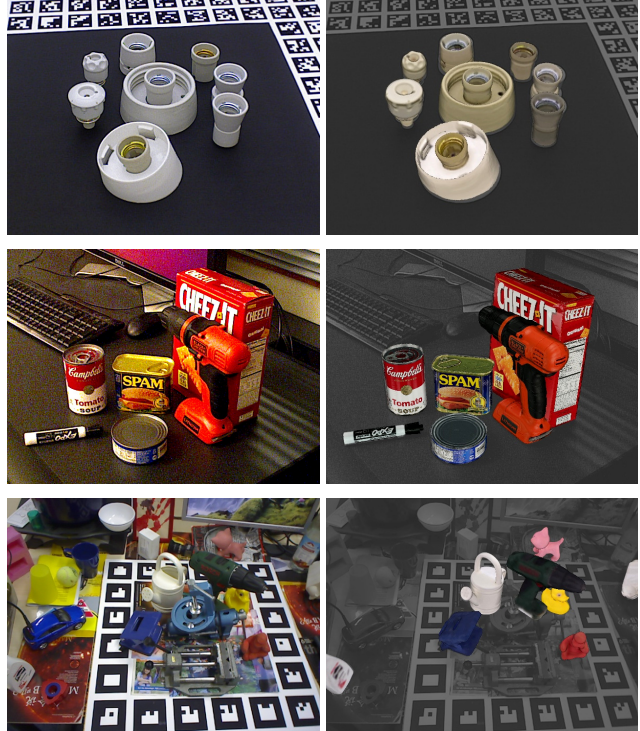
Figure 3. Example EPOS results on T-LESS (top), YCB-V (middle) and LM-O (bottom). On the right are renderings of the 3D object models in poses estimated from the RGB images on the left. All eight LM-O objects, including two truncated ones, are detected in the bottom example. More examples are on the project website.