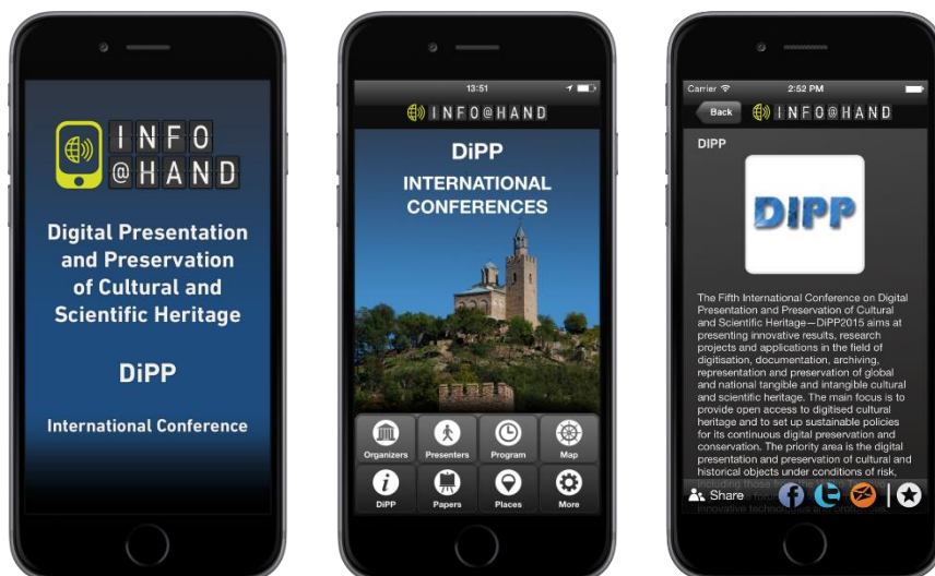
Fig. 3. Screenshots from INFO@HAND DIPP.