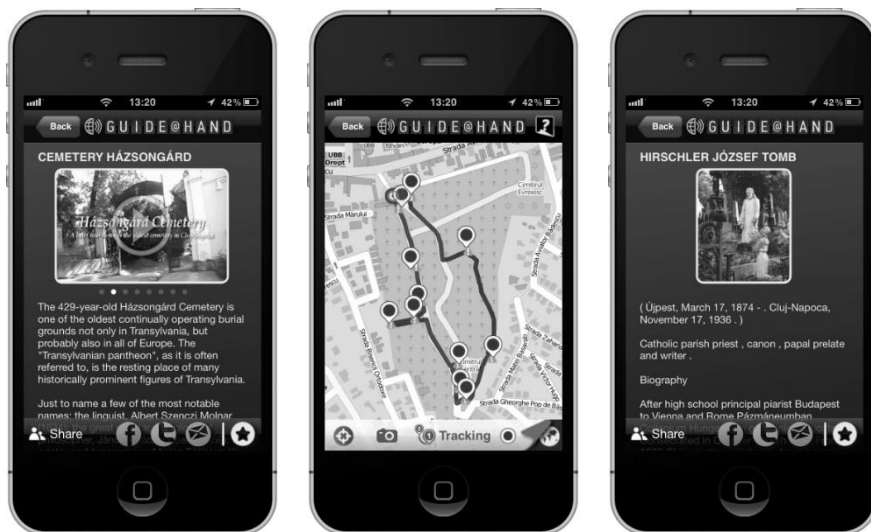
Fig. 2. Screenshots from the walk in Cemetery Házsongárd showing the general description with video, the route and the description of a tomb.

The users may take pictures, record voice memos or take notes during the walk. After finishing the walk, they can save them together with the track of the walk and share their experiences on the Web (e.g. in Facebook). This way they can present a personalized virtual tour of the cemetery to their friends.