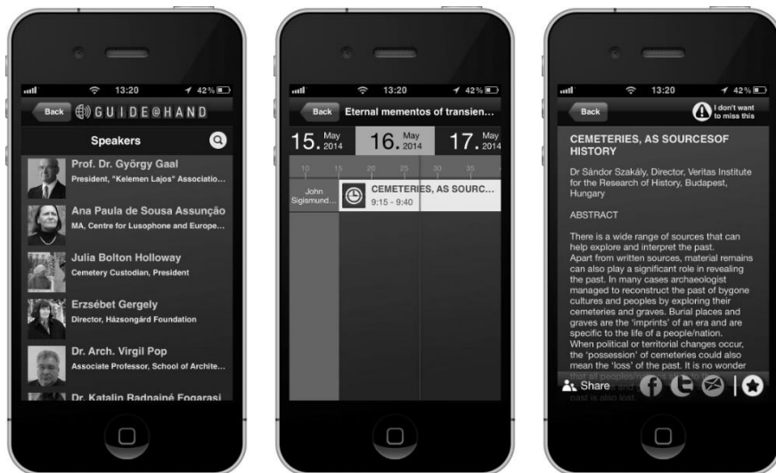
Fig. 1. Screenshots from the conference guide showing the list of speakers, the seminar programme and the description of a talk.

The users can get the list of speakers, as well. After selecting a speaker, the user can get detailed information including the name, picture, the affiliation, the job title, the biography and the contact information of the speaker. The pictures are very useful for associating the provided information and the people the user personally meets during the seminar.