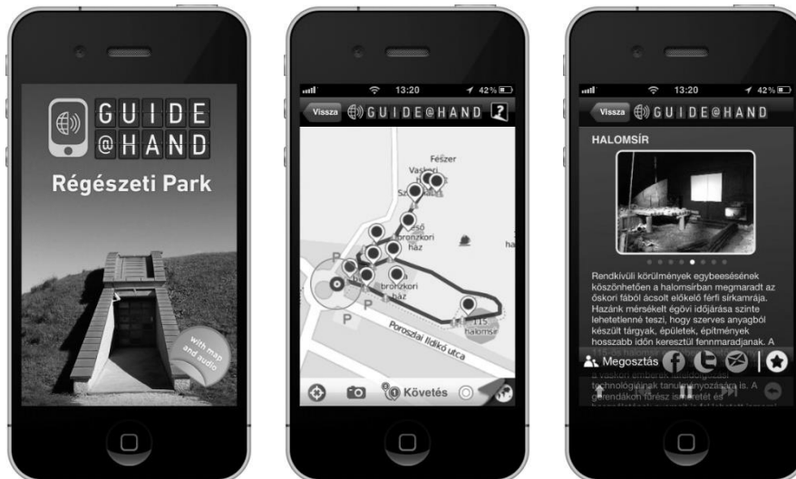
Fig. 4. Screenshots from the GUIDE@HAND application for Archeological Park Matrica. The opening screen of the application depicts the entrance to a barrow. The second and the third picture show the route of a guided walk in the park and the description of a barrow, respectively.

The mobile interpretation of burial grounds has been successfully implemented not only for currently operating cemeteries but also for ancient burial grounds. We created a mobile application for the Archeological Park of Matrica Museum located in Százhalombatta, Hungary [4].